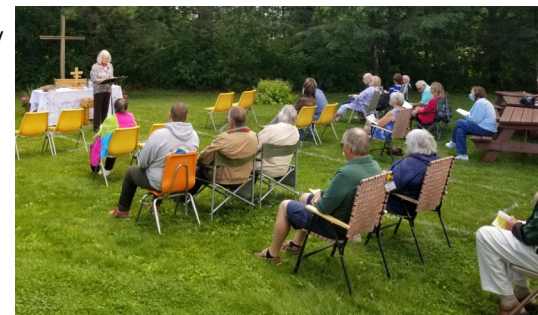
Outdoor worship — finally OUTDOOR!

Our next WMMT meeting will be July 13, 2020. Please feel free to send questions, or concerns to our team. Our goal is to have the entire family back here at Trinity.